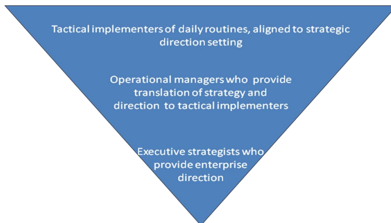
Figure 1. Levels of Commitment

Everyone is in sales. What does this mean? You may work in research and development, or in finance, or in technology, or perhaps in human resources. Your job title might even refer to serving the customer. The real fact of today's complex and turbulent world of products and services, solutions, and continuous change is that all must be customer-centric in approaching their jobs. Complex times call for complex solutions. As change affects your world and that of your customers, they need you to be responsive to their ever changing needs. A virtual partnership must evolve that includes your customer and everyone in your organization. It is not enough for just your sales professionals to have this relationship. This implies that everyone in your organization understands the customer and what will incent that customer to continue to buy your products and services. That means that everyone is in sales: senior management, who must invest necessary dollars in customer-centric programming; senior sales leaders, who must invest time and commitment to sales professionals; sales professionals, who must invest their energy and commitment to developing their sales skills and expertise; and all other members of your organization, who must understand the sales workflow and customer needs in that process.