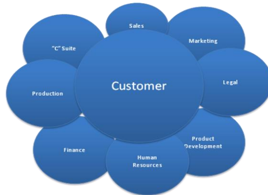
Figure 2: Sales Culture

Let's move on to describing the stakeholders.