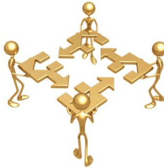
Figure 3. A Virtual Team

When employees understand these connections, they are able to create a sales culture within their organization. Forming and leading virtual teams to facilitate successful sale closings, then, requires that the sales professional prepare and educate the supporting employees to be good contributors to their virtual teams. This includes creating transparency around the sales workflow, a solid understanding of the art and science of sales, and an expectation of accountability for contributing one's expertise to customer, as well as team, needs.